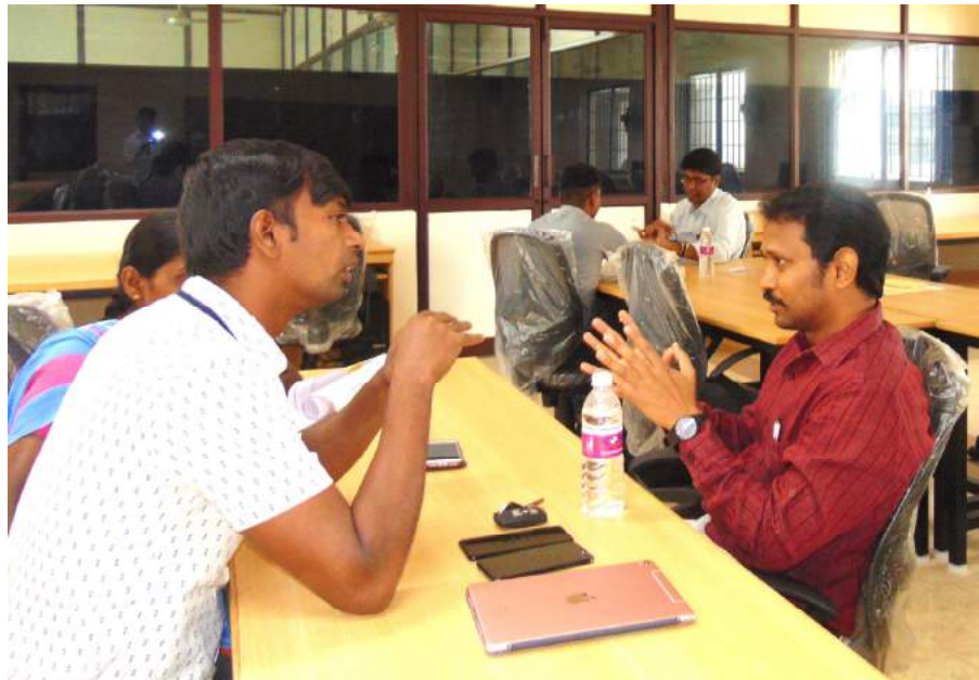
Mentor interacting with participants of Boot Camp