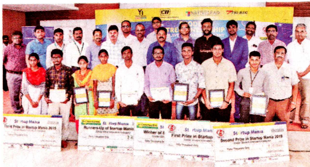
Student winners and other innovators of the Startup Mania competitions that was held in Erode recently.