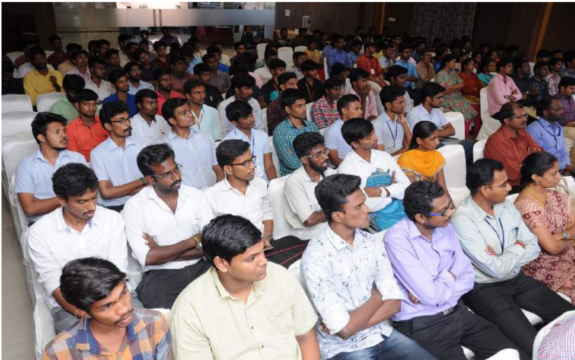
Guests and Participants at the Conference cum Award Ceremony