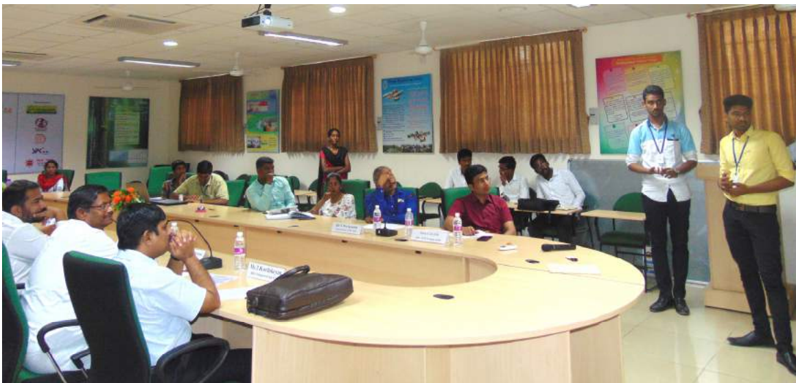
Innovator Presenting under Student Category