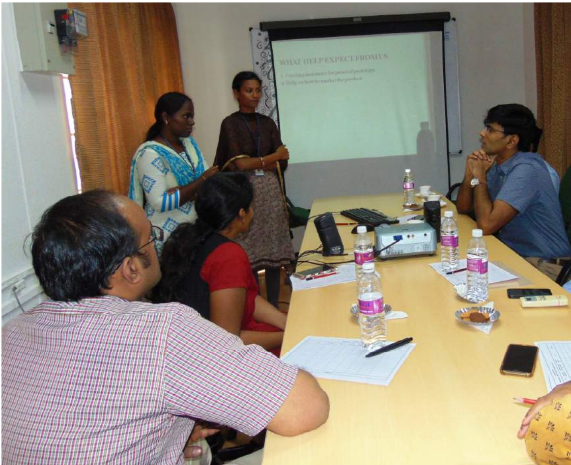
Members of Panel -4 during prelims selecting ideas for Boot Camp and Finals