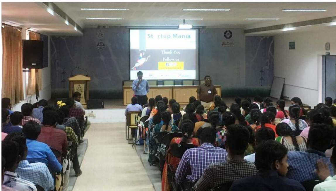
Road Show about Startup Mania to students