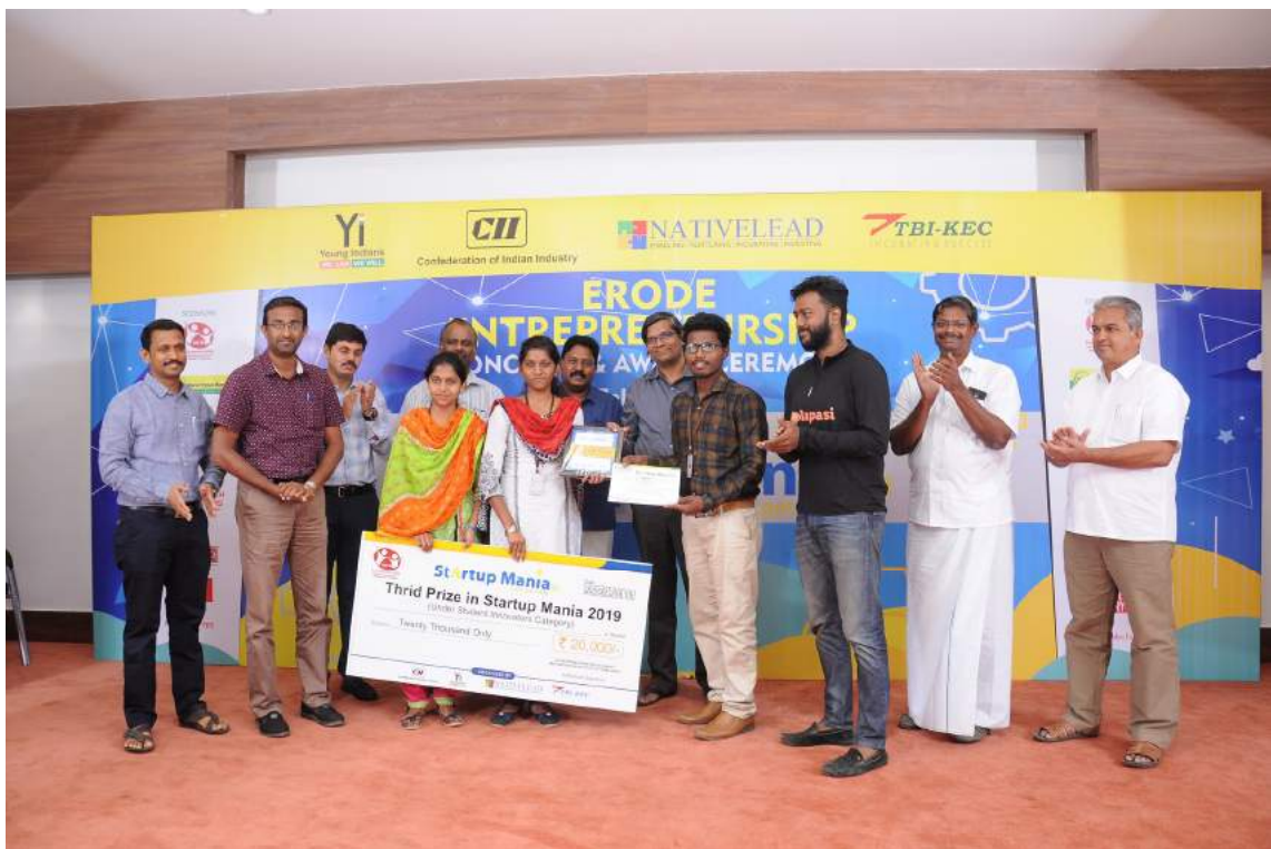
3 rd Prize “IoT Based Automatic Dual Row Turmeric Planting Agribot” under Student Innovators Category