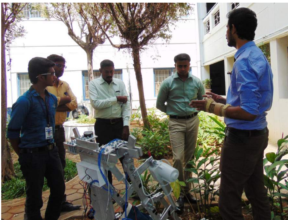
Demo of the project to Members of Panel during prelims