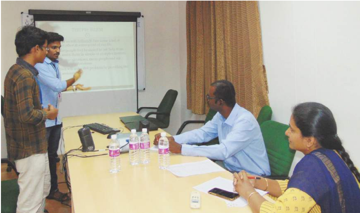
Members of Panel -1 during prelims selecting ideas for Boot Camp and Finals

On 12.02.2019, 13 members in 5 panels (4 for students and 1 for other innovators) reviewed the ideas presented by shortlisted innovators. 12 ideas from students and 6 ideas from other innovators were shortlisted for the Bootcamp on 20 & 21 Feb'19 & Finals on 22 Feb'19 FN at TBI@KEC.