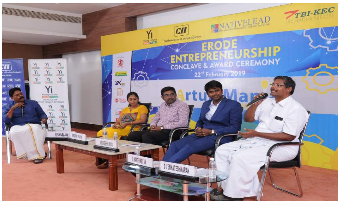
Panel discussion on the topic “Startup Ecosystem”