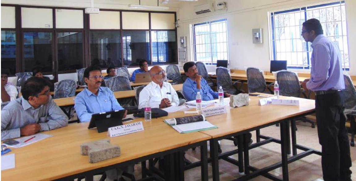
Innovator Presenting under Other category

Final Pitch was held on Feb 22, 2019 FN at TBI@KEC. 2 panels consists of 3 and 5 members in each have selected the top 3 winners under students and top 2 under others category.