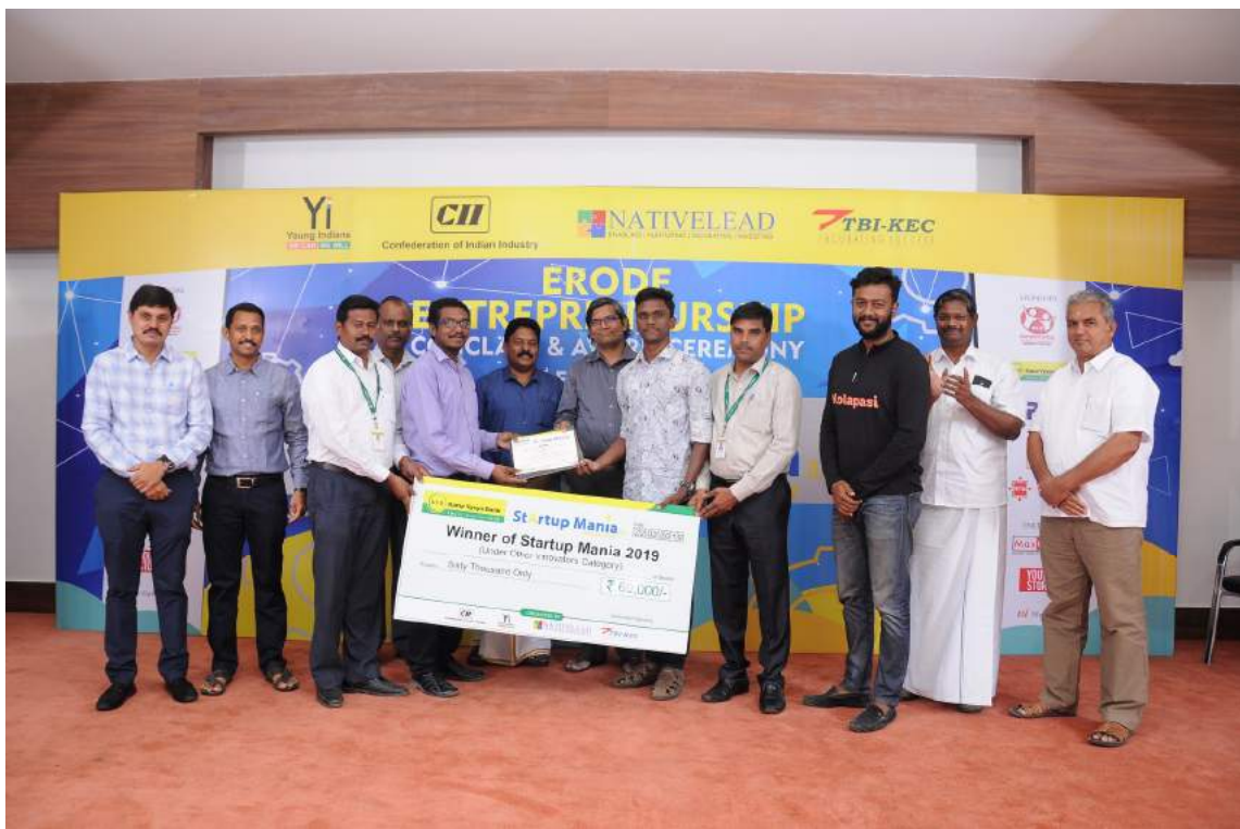
“Eco-Friendly construction Blocks from C&D Debris using CO2 Sequestration Technique” Winner under Other Innovators Category