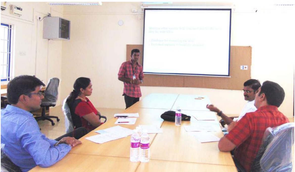
Members of Panel -2 during prelims selecting ideas for Boot Camp and Finals