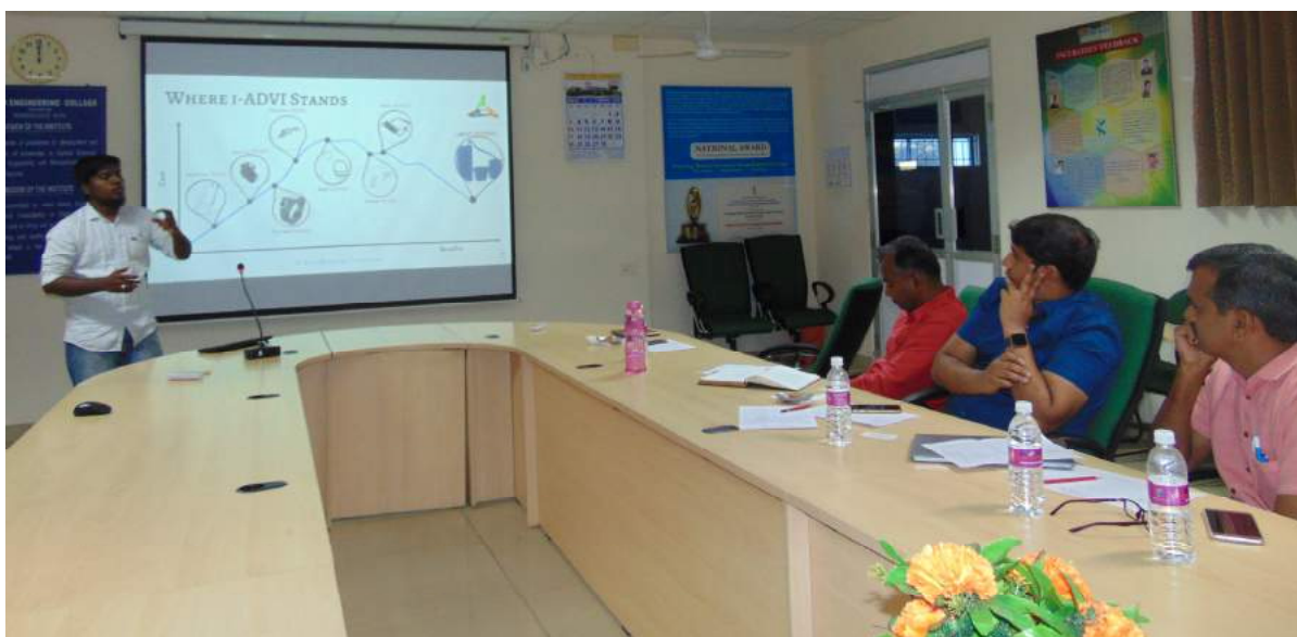
Members of Panel -5 during prelims selecting ideas for Boot Camp and Finals