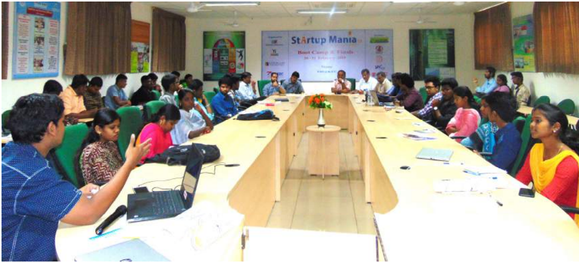
Participants interacting with mentors during Boot Camp