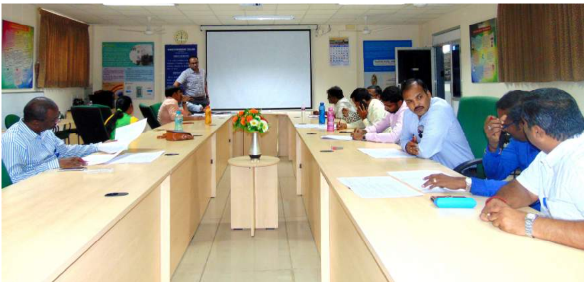
Team of Panelists along with organizers short listing Ideas Received under both category for Prelims