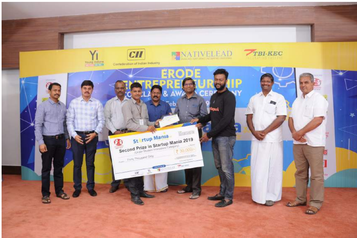
2 nd Prize “Design and Development of Multi-Functional Geometric Tools” under Student Innovators Category