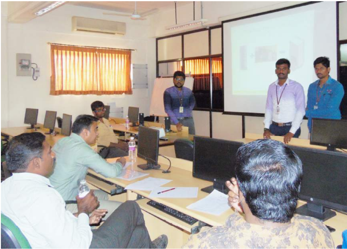
Members of Panel - 3 during prelims selecting ideas for Boot Camp and Finals