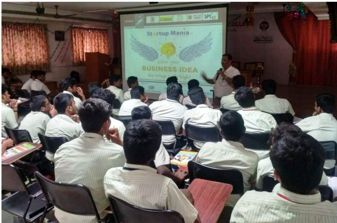
Road Show about Startup Mania to students

Startup Mania promotional campaign was done through diverse methods such as Press Release, Mails to Colleges, Social Media - Facebook, WhatsApp, LinkedIn, FM Radios and in particular through Road shows in colleges in and around Erode. Mails and Posters were sending to all Engineering, Arts and Science, Polytechnic, Agri Colleges and B-Schools.