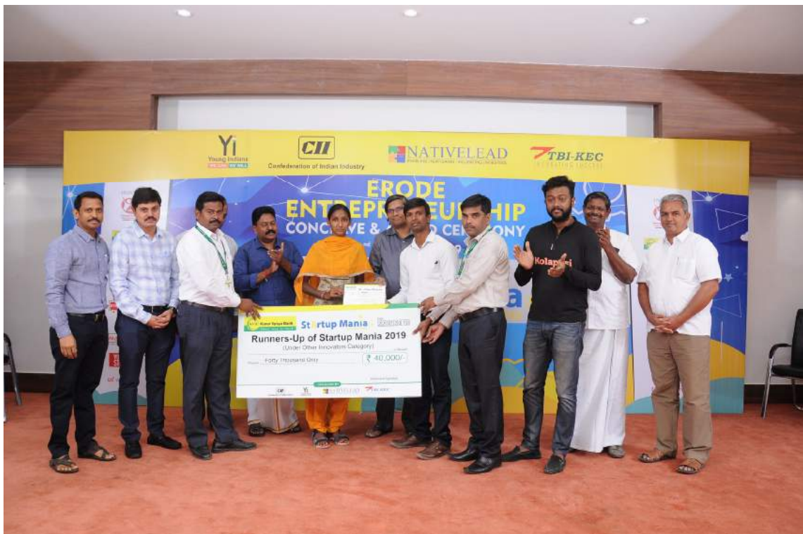
“Instant GPFR Wall Panel” Runner-up under Other Innovators Category