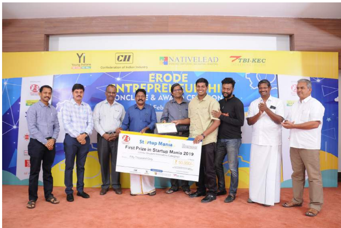
1 st Prize “Tooth Pod” under Student Innovators Category