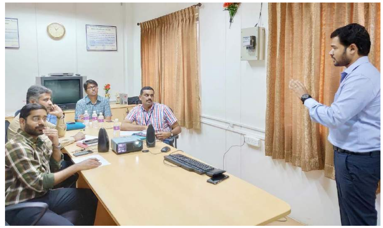
Members of Panel -5 during prelims selecting ideas of others for Boot Camp and Finals