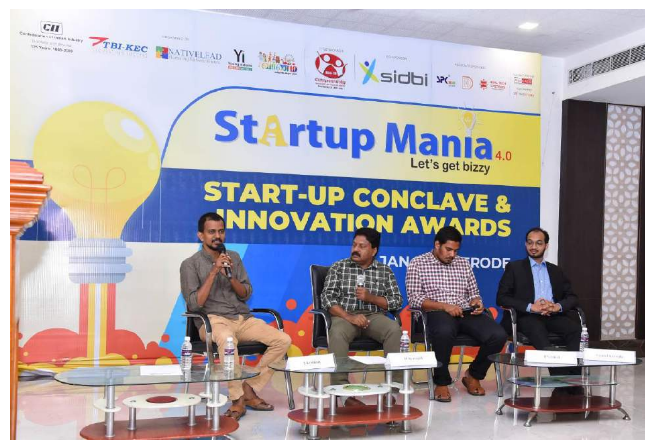
Panel discussion on the topic "Innovation – The Survival Mantra"