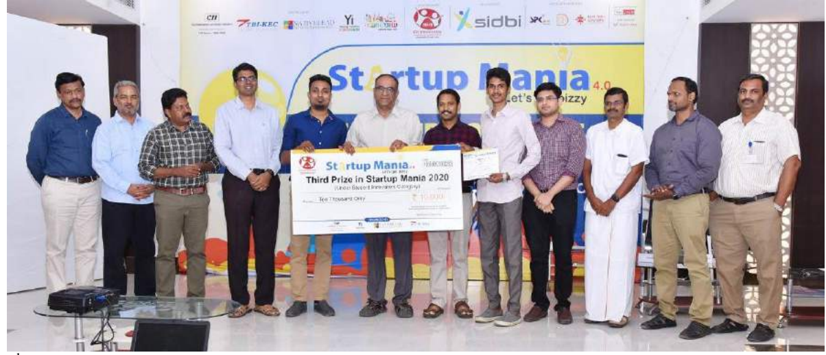
3<sup>rd</sup> Prize "HHH – Helping Hand for Hearing Impaired Persons" under Student Innovators Category