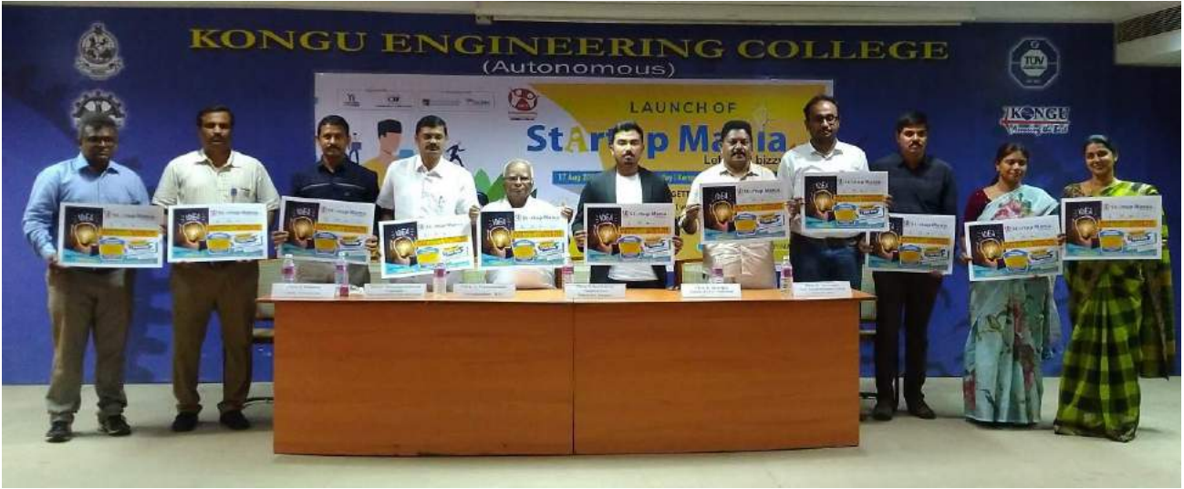
Official launch of Startup Mania 4.0 2020