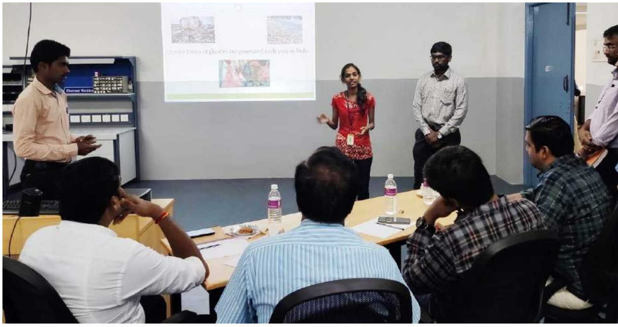
Members of Panel -4 during prelims selecting ideas of students for Boot Camp and Finals