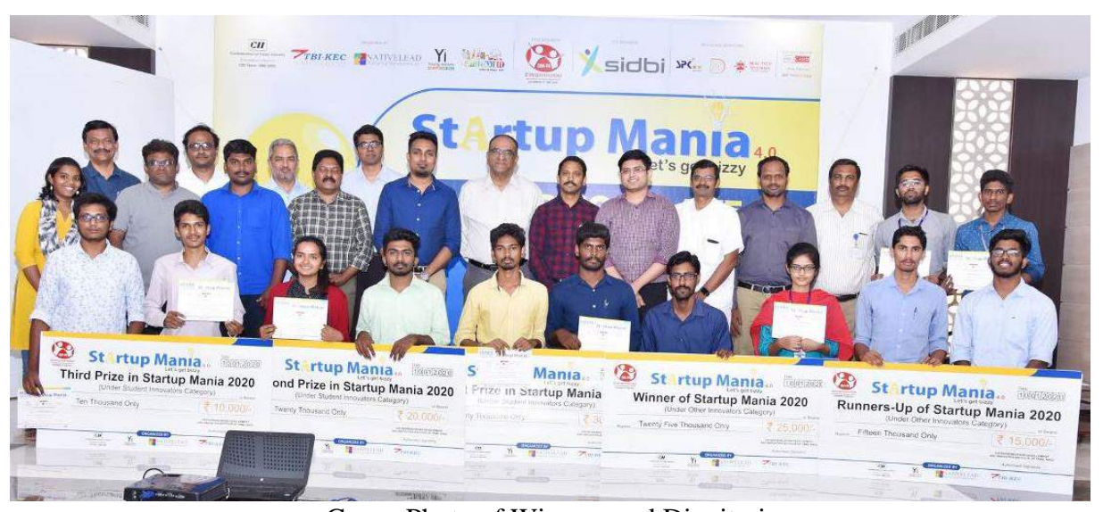
Group Photo of Winners and Dignitaries