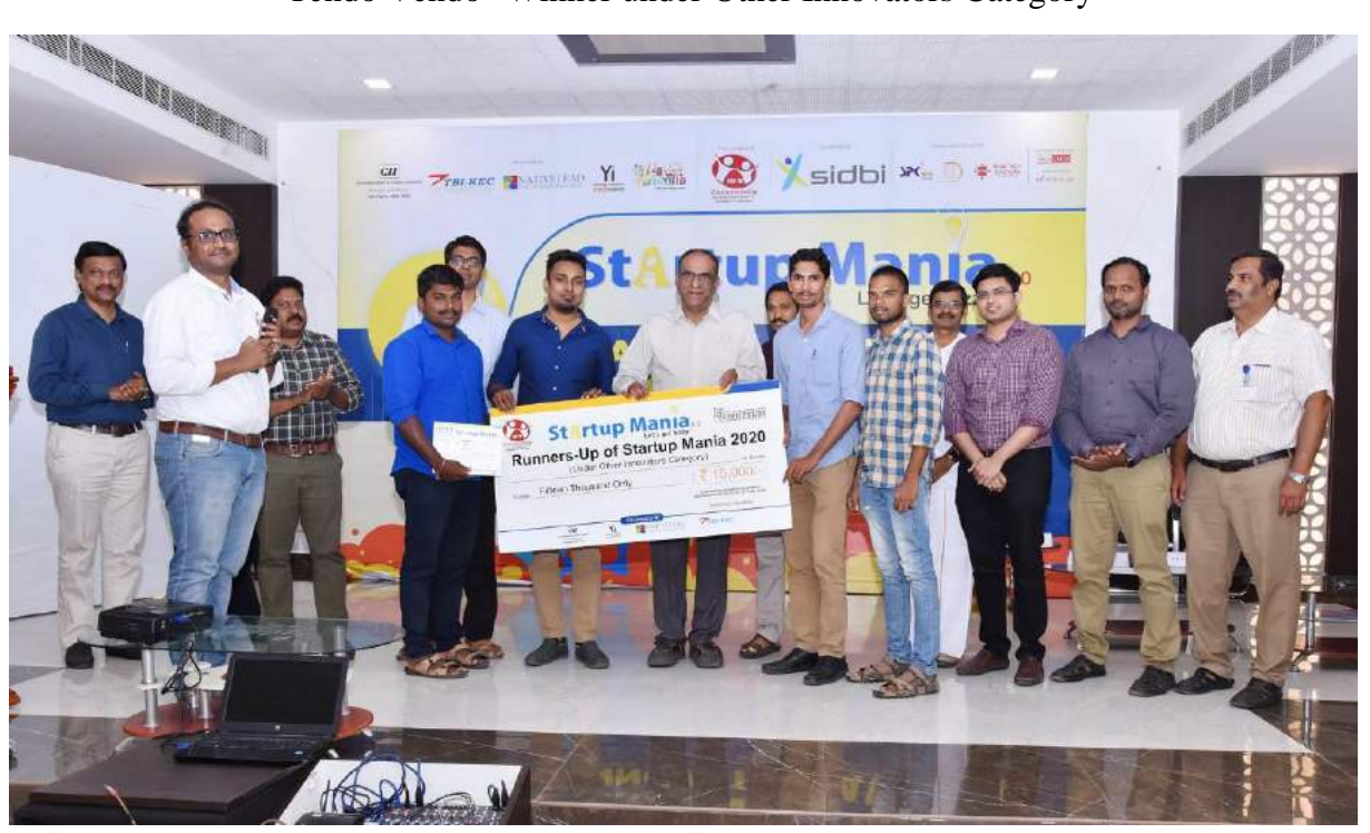
"Sport Wander - A Platform to Develop Sports" Runner-up under Other Innovators Category