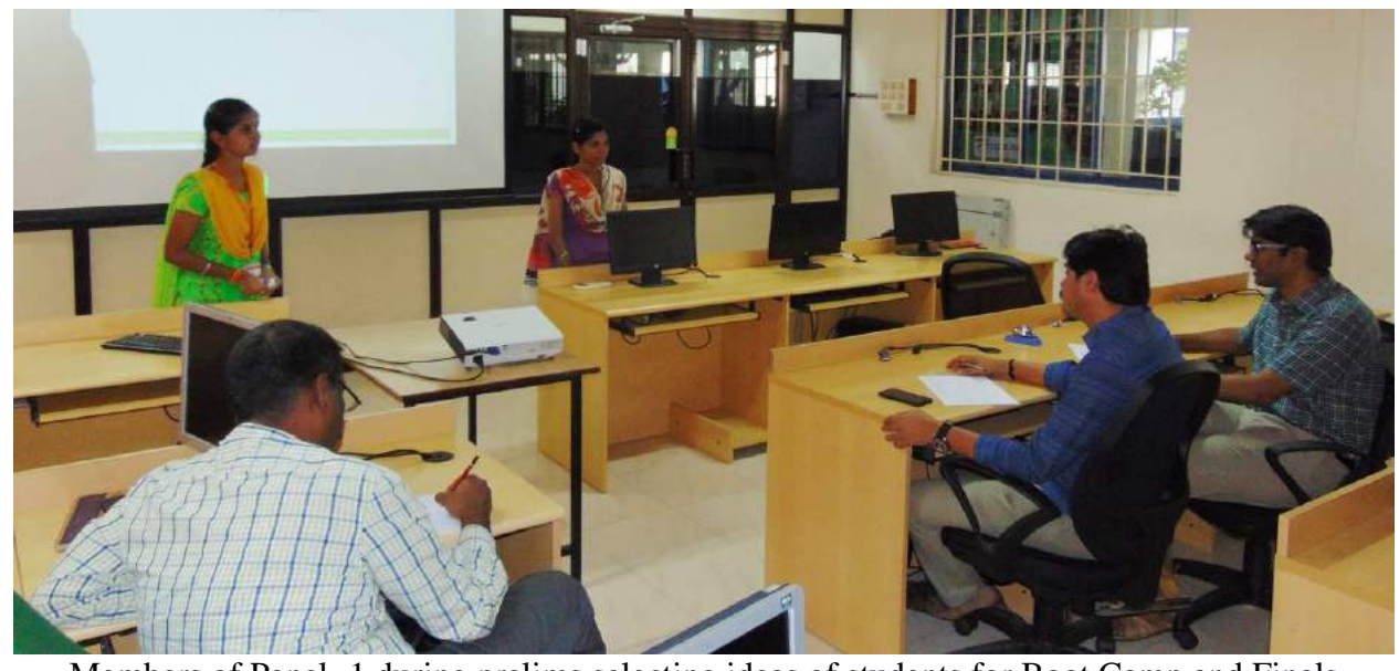
Members of Panel -1 during prelims selecting ideas of students for Boot Camp and Finals

On 20.12.2019, 5 panels comprising of 18 members (4 for students and 1 for other innovators) reviewed the ideas presented by shortlisted innovators. 13 ideas from students and 5 ideas from other innovators were shortlisted for the Bootcamp & Finals.