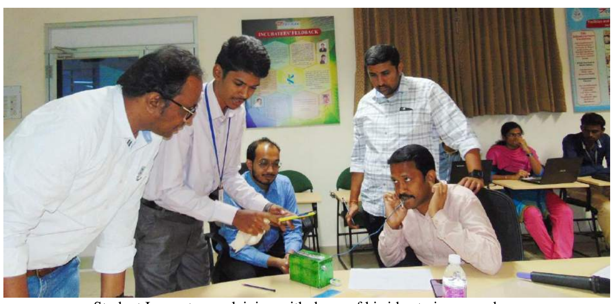
Student Innovator explaining with demo of his idea to jury members