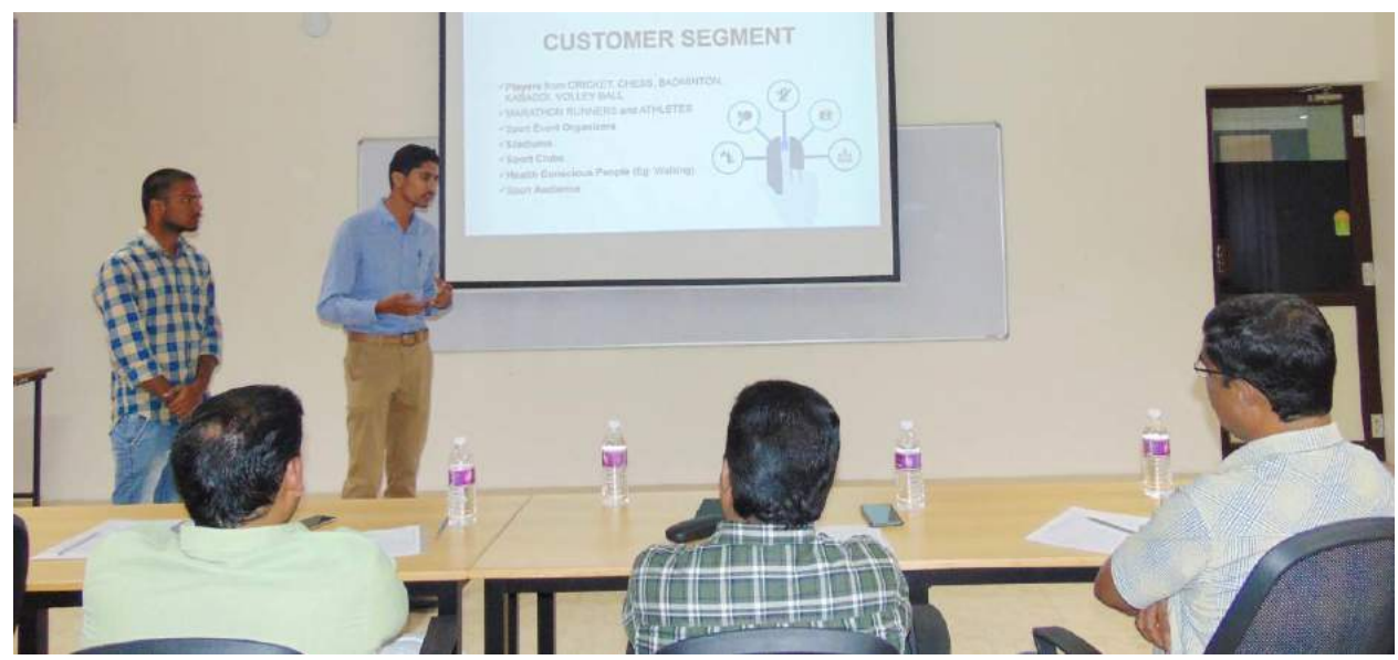
Innovator Presenting under Other category

Final Pitch was held on Jan 10, 2020 FN at TBI@KEC. 2 jury panels had selected the top 3 winners under students and top 2 under others category.