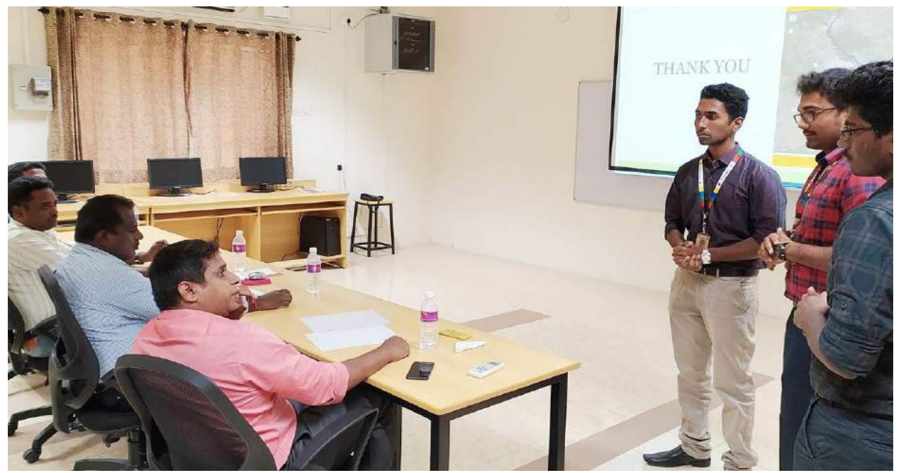
Members of Panel -2 during prelims selecting ideas of students for Boot Camp and Finals