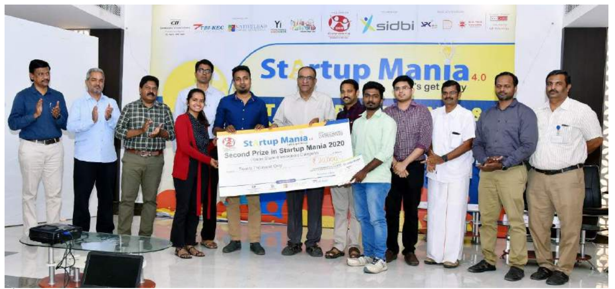
2<sup>nd</sup> Prize "iHALE Preemptive Alert System for Asthmatics" under Student Innovators Category