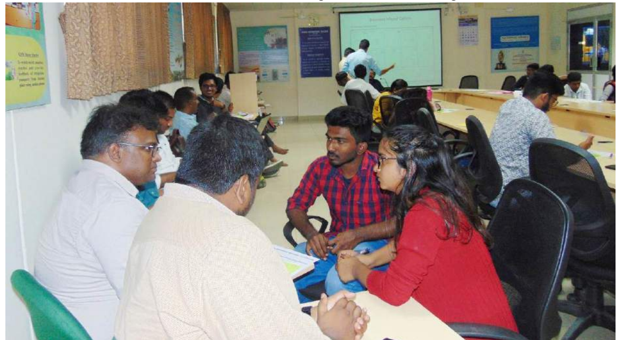
Participants interacting with mentors during Boot Camp