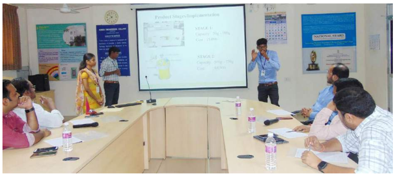
Innovator Presenting under Student Category