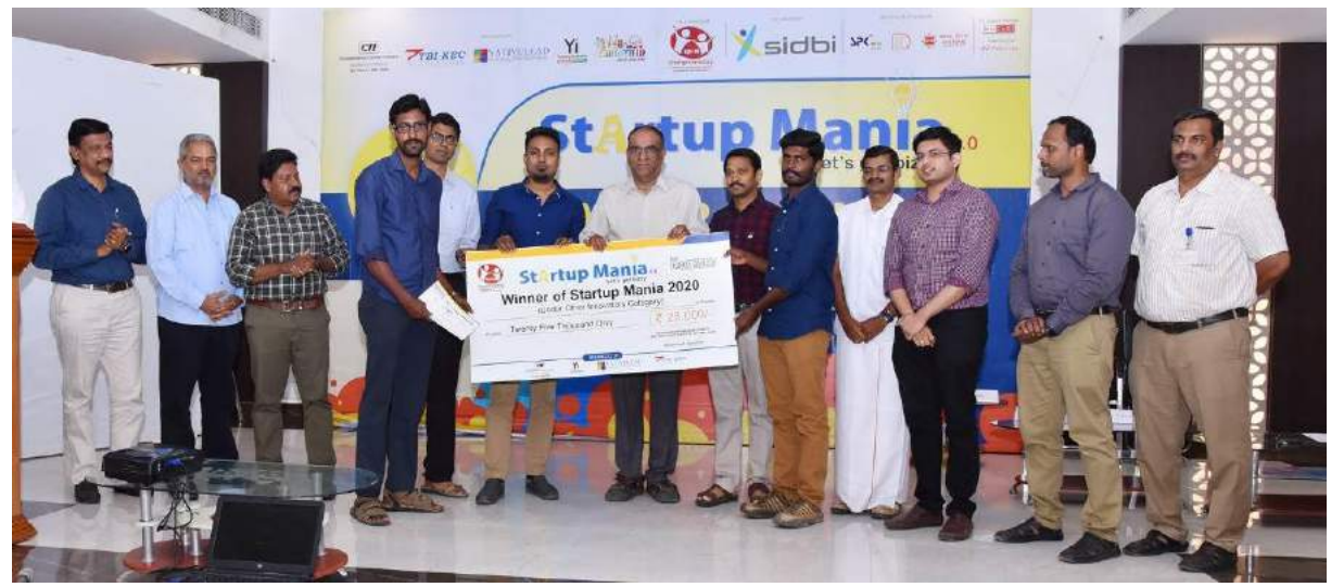
"Tendo Vendo" Winner under Other Innovators Category