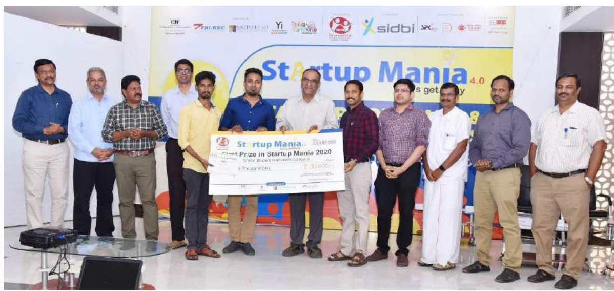
1st Prize "Mosquito Killing Machine" under Student Innovators Category

The Startup Conclave concluded by awarding winners under Students and Others categories with a cash prize of Rs.30,000/-, Rs.20,000/- and Rs.10,000/- to student winners (1<sup>st</sup>, 2<sup>nd</sup> & 3<sup>rd</sup>) and cash prize of Rs.25,000/- and Rs.15,000/- to winners of others category (winner & Runner-up). Sponsored by EDII, Government of TamilNadu.